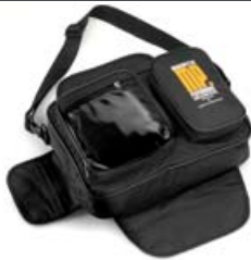
TANK BAG, MAGNETIC, A4 SIZE 08L56KAZ800