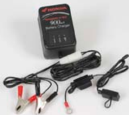
BATTERY CHARGER L08BATAC900MB