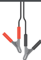
CROCODILE CLAMPS 08M51AMCLAMPS