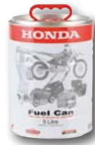
FUEL CAN (5 LITRE) L1294P07001