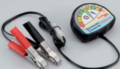
BATTERY TESTER 08M51EWA800ZA